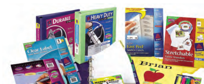
school & office supplies

Visit btfе.com/products for a complete list of participating Box Tops products